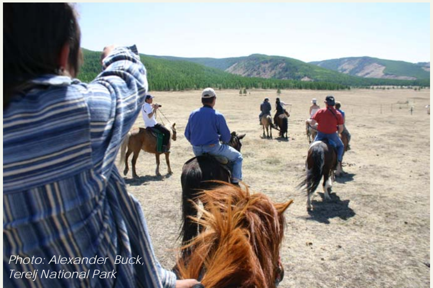
Terej National Park